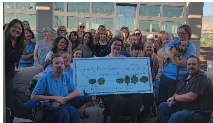
In May of 2022, we won the donation from 100 Women 4 Good Boise.